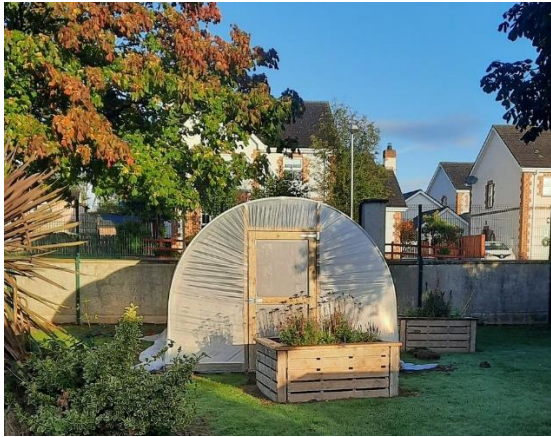
Our beautiful new polytunnel above.

Below our Reception children on their 1 st Day!