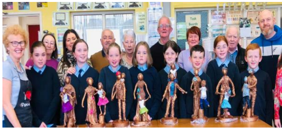
Above: Intergenerational Sculpture Workshop

We are now collecting prizes for the draw, if you are able to donate a prize no matter how small we will gladly accept. We are also collecting bottles for the popular bottle stall. All the usual favourites including the BBQ will be available on the afternoon of the event. We estimate that the event will run on to approximately 5.30pm. We look forward to a safe and enjoyable afternoon.