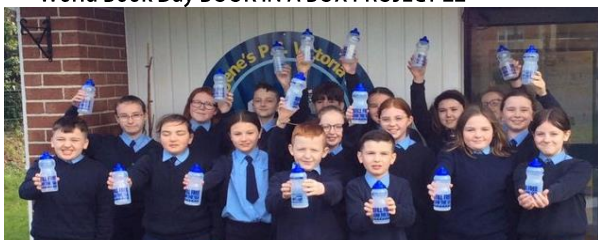
The Eco-Committee had a super workshop with NI Water. Representatives from our Eco-Committee then educated our other classes on conserving water and provided everyone in our school with a reusable water bottle.