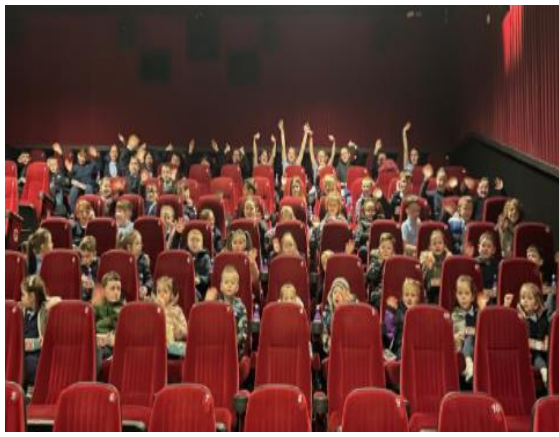
Above: Whole School Wellbeing Cinema Trip