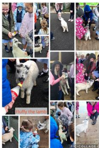
Above: Fluffy the lamb visits St Eugene's PS