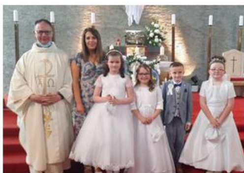
Above: P4 First Communion Children