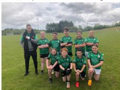
Above: KS2 Gaelic Team competing at an out of school blitz in Dromore. Below: Shared Education trip to Gortin Glens.